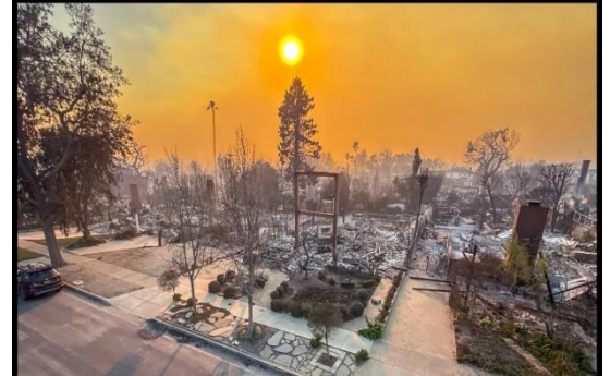
Palisades, Jan. 9, 2025, rows of beautiful homes destroyed, but trees and bushes left standing.

“The LA Fires – Is this the New Norm in Fires? Do We Have Any Truly Normal Fires Anymore?”