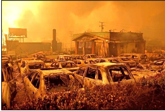
Altadena Auto Center, Altadena, CA Jan. 8, 2025

Invites you to our January 30, 2025 Meeting