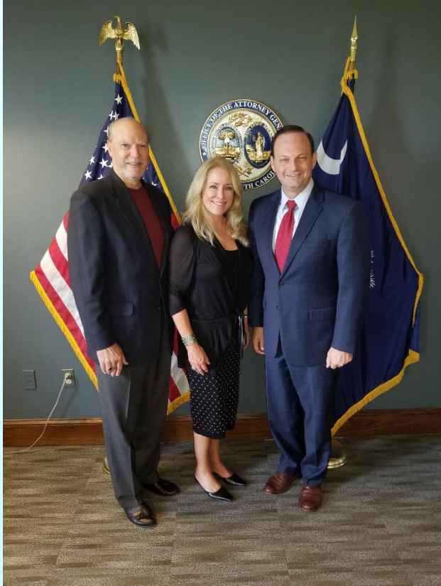
S.C. Attorney General Alan Wilson