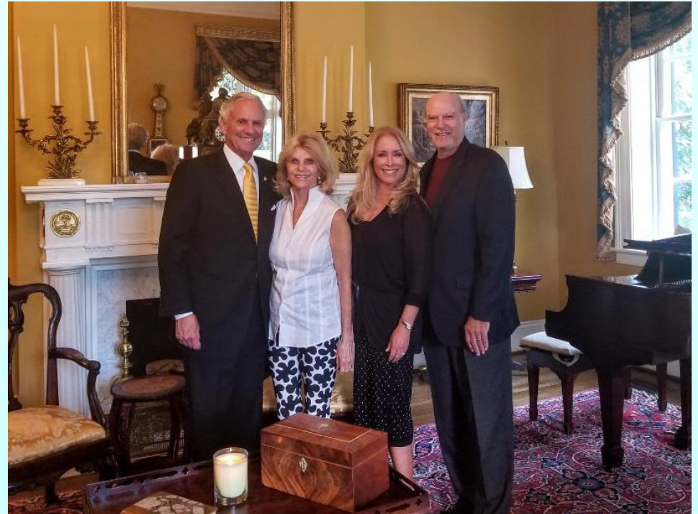
S.C. First Lady and Gov. Henry McMaster