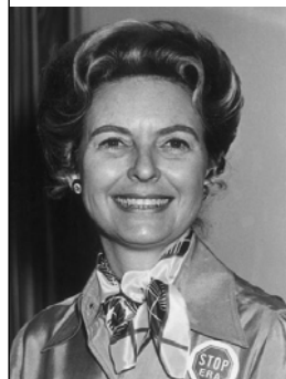
Phyllis Schlafly in 1972 with a Stop ERA button on her jacket.

History of the ERA: The Equal Rights Amendment was passed by the house in 1972 and by the Senate in 1973, and then sent out to the states for ratification. It was immediately adopted by 30 states, then slowly by 5 more states, but it needed 38 states to become an amendment to the Constitution. Even though Congress extended the deadline for another 3 years, they could never get the last 3 states. It was ruled null and void in 1982.